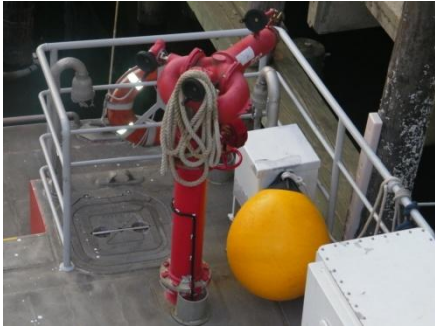
Plenty of Fire Power