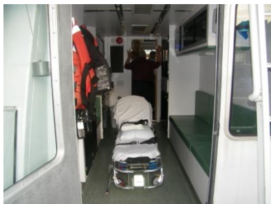
Part of the cabin Matches Portland Rescues