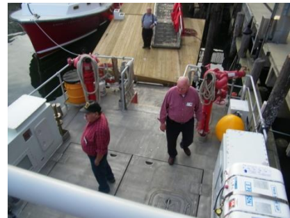
Looking down into the cockpit