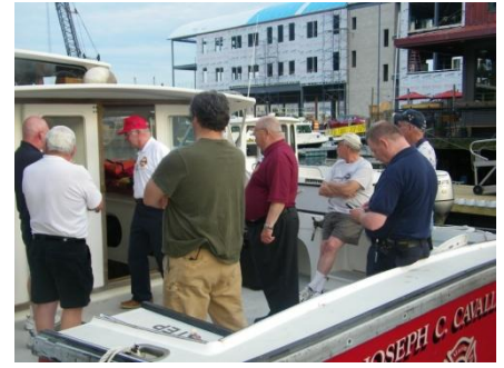
Gathered in the Cockpit