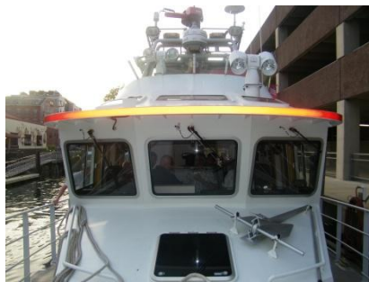
Head on shot