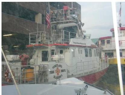
The new boat. Parking is tight here

The vessels and some added info are shown below: