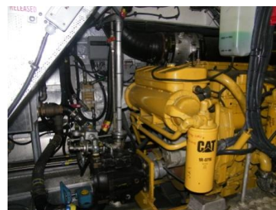
Powered by two 600 HP CATS Good workspace around them