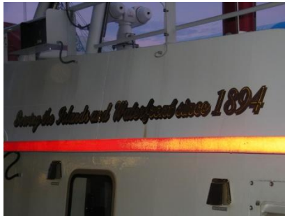
Proudly Serving the City