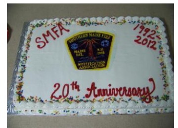
Refreshments, Of Course

With great repeater coverage and a strong membership, the eBoard has approved a project, to first interconnect the repeaters, using VoIP technology, to allow ALL our members better access to get the word out. Then to use VoIP technology on the internet to allow wider access for our members.