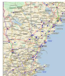
Where We Live