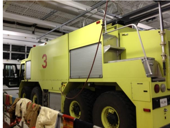
One of the "big boys", there are 3 in all