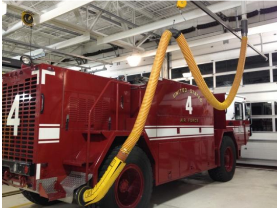
The small fast CFR