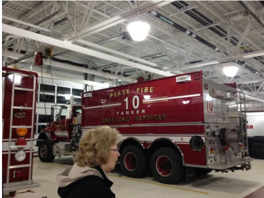
Their 4000 gallon tanker