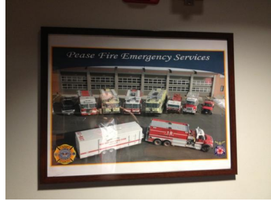
Here's the only way we could see ALL of the apparatus at once. The tanker in front with hazmat trailer

The entire line up has those units, plus: structural engine, squad, 3 large CFR units, one small fast CFR unit, The command SUV and a utility pickup. Ten units in all. Many of us would love to be able to call the 4000 gallon tanker when we need it !