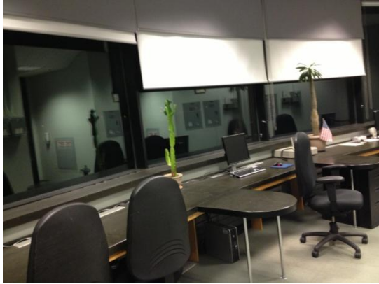
The Office and Commanding View !!