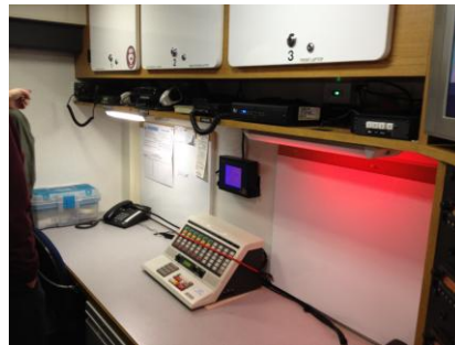
One Radio Console Position and It's Radios