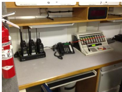
Second Console Position