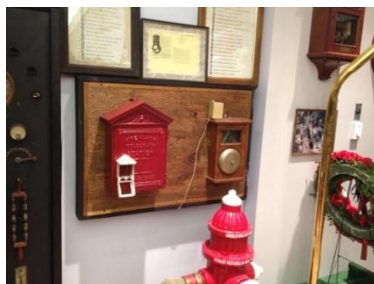
More Alarm Antiques