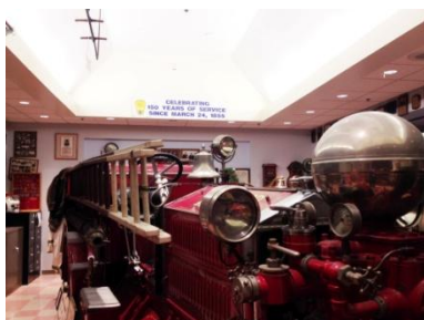
And "The Fox" Proud of their heritage Serving Since 1855 !