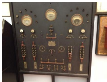
Many alarm antiques were on display for those collectors