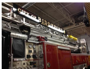
The new Tower - "That's Truck Thirty-Two" Difficult to capture indoors !!